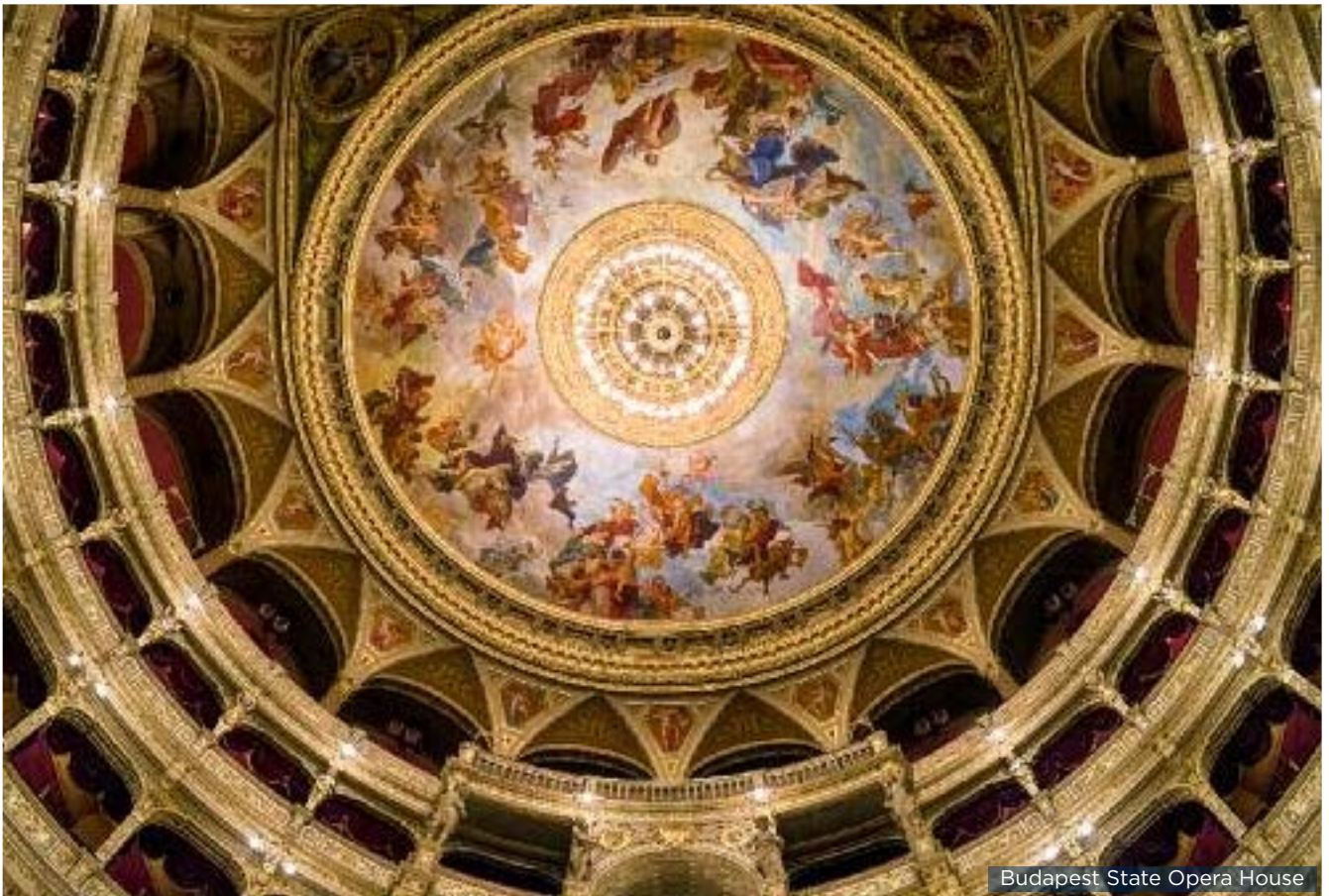
Budapest State Opera House