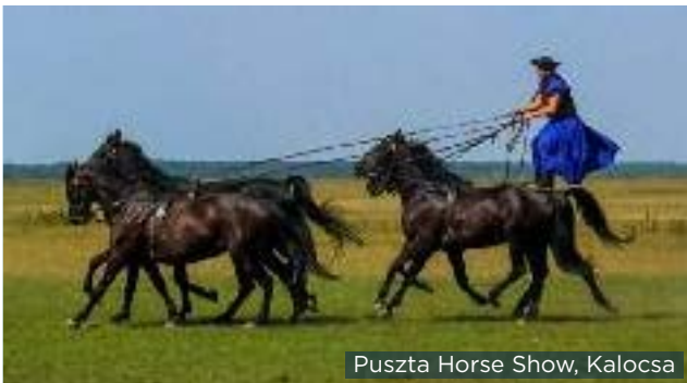
Puszta Horse Show, Kalocsa

Let MS Royal Crown transport you along the Danube, Main and Rhine rivers to great imperial cities, historic towns and charming villages through ever-changing scenery, uncovering local heritage and experiencing musical performances, wine tastings and architectural gems along the way. Pages 18-29