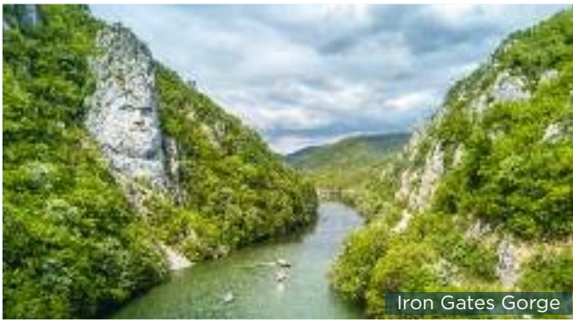
Iron Gates Gorge