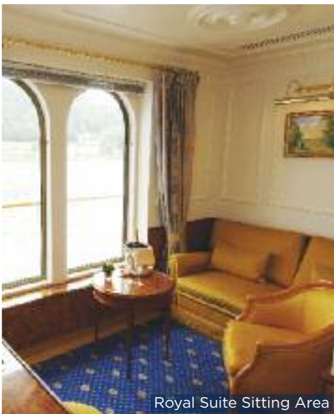
Royal Suite Sitting Area