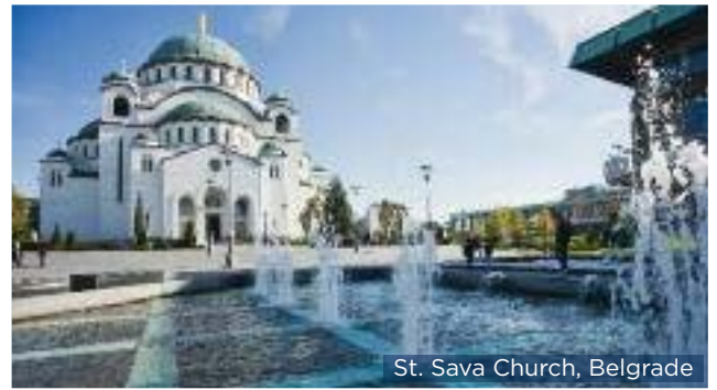
St. Sava Church, Belgrade

Join Hebridean River Cruises for the ultimate grand voyage across Europe as we sail from East to West through nine countries. Awake every morning to a different view, travel in style and comfort and enjoy the thrill and enrichment of our guided excursions and guest speaker lectures. Pages 18-33