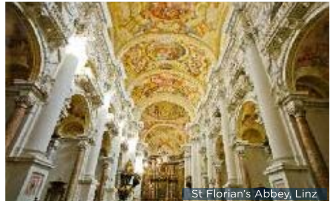
St Florian's Abbey, Linz

After breakfast we must say farewell as we disembark MS Royal Crown for our transfer to the airport and our accompanied onward flight home.