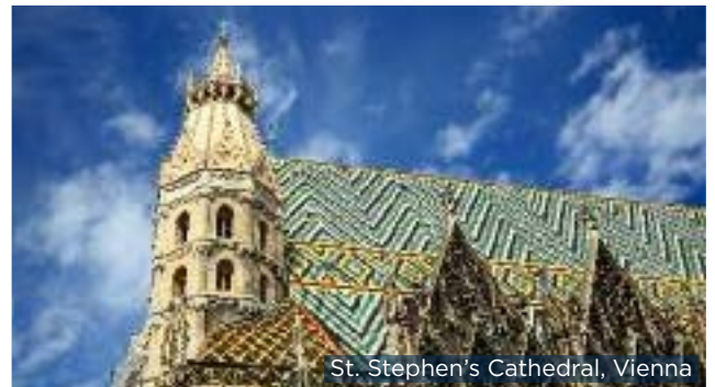
St. Stephen's Cathedral, Vienna

Cruise serenely along the 'River of Kings' from the Black Sea and delta wetlands in the east to the medieval city of Nuremberg in the heart of Europe whilst absorbing stunning views and the unique atmosphere of each port of call. Pages 18-25