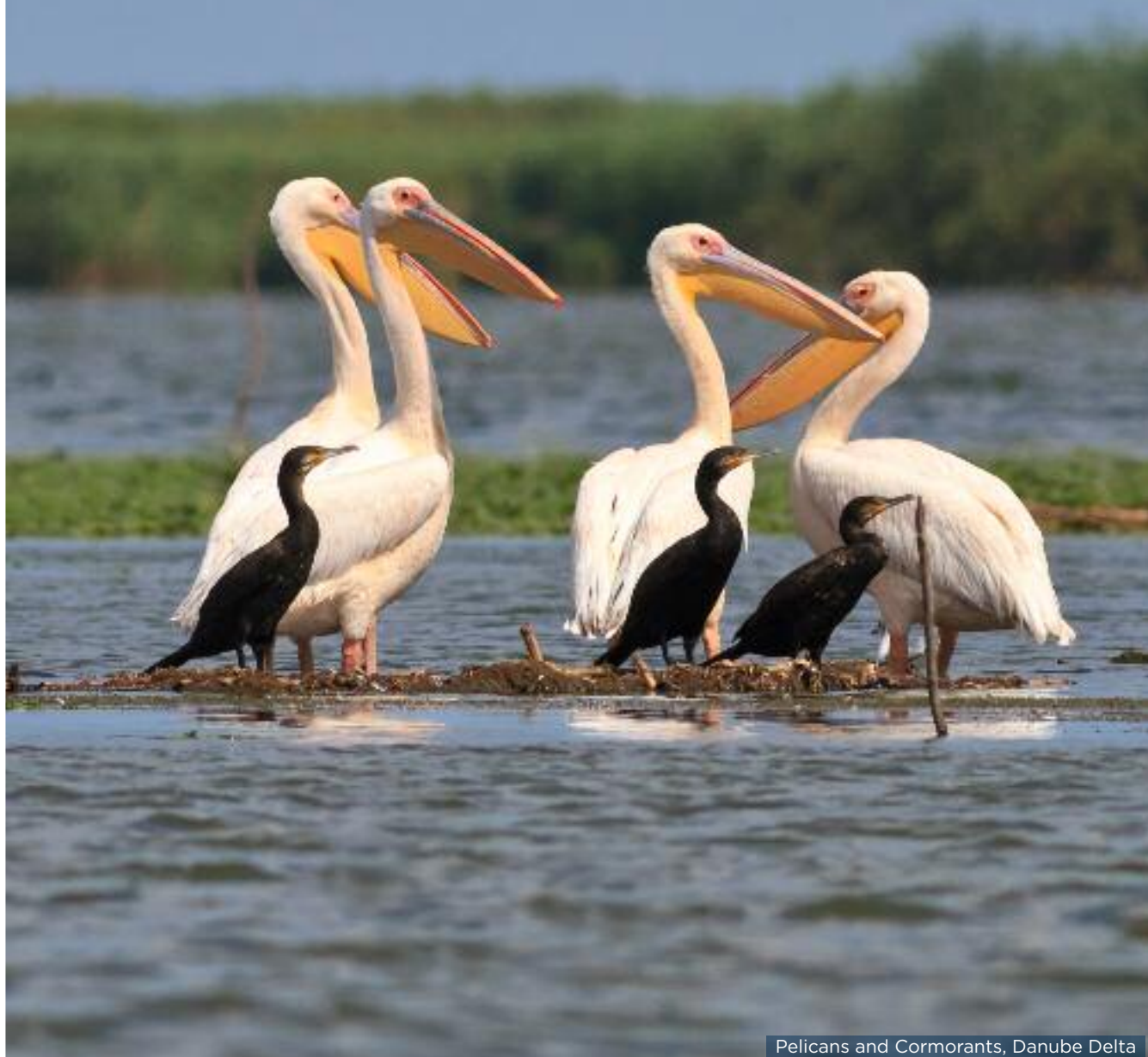
Pelicans and Cormorants, Danube Delta