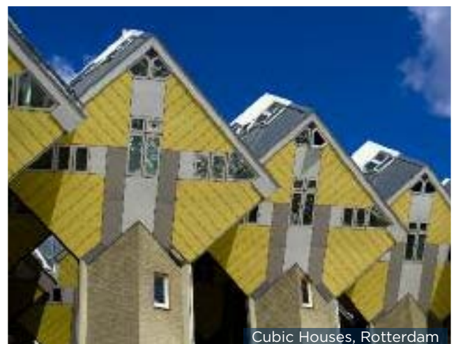
Cubic Houses, Rotterdam

Full board including house wines, Taittinger champagne by the glass, spirits, beers, soft drinks, tea and coffee. All shore excursions. Guest Speaker. Cruise Director. Tour Manager. Gratuities. Complimentary Wi-Fi on board. Overseas Transfers. Port taxes. Airport taxes. Travel Insurance not included.