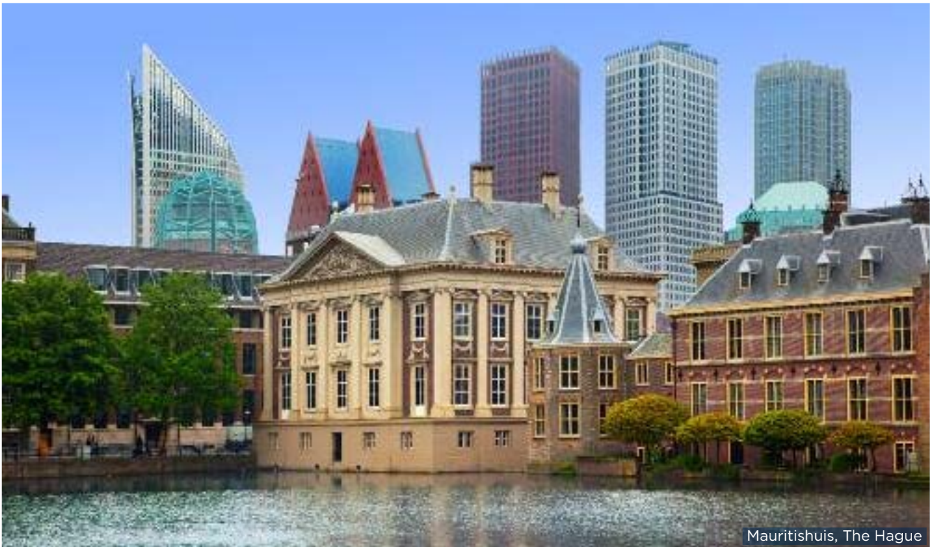
Mauritshuis, The Hague