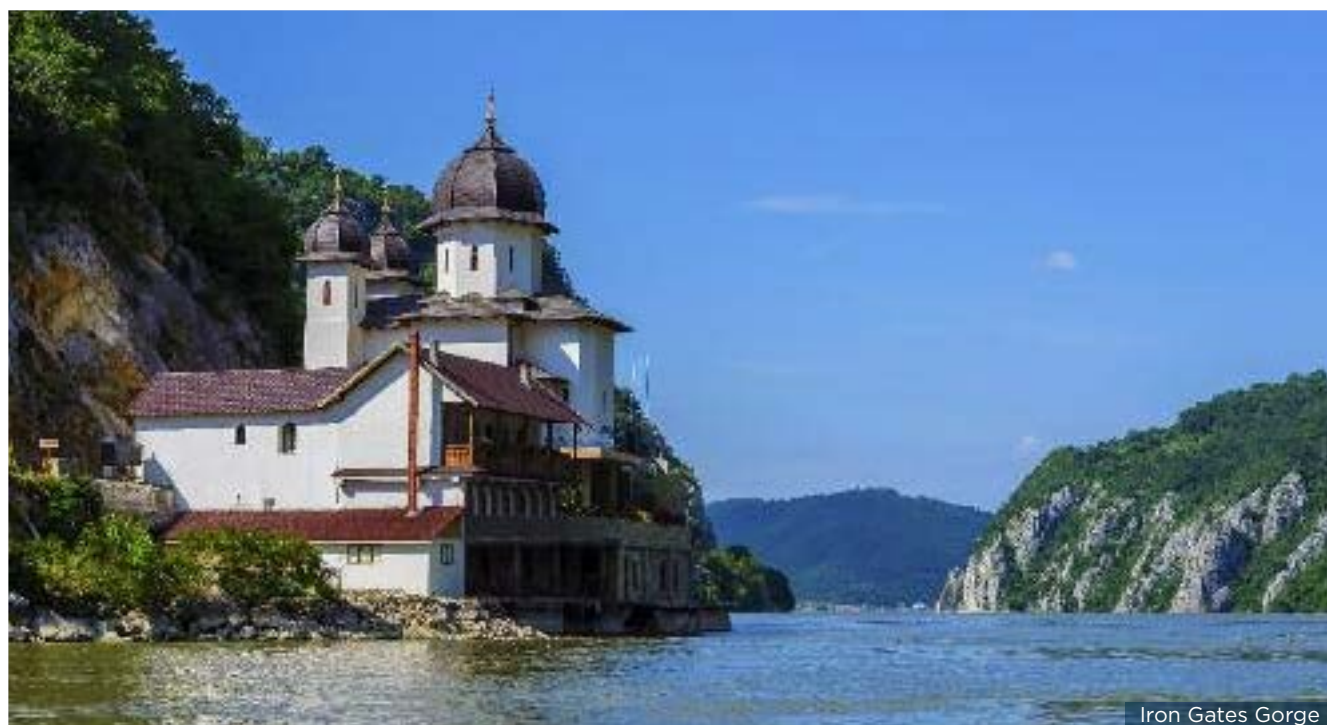
Iron Gates Gorge

On arrival in Kalocsa, we take a tour of this beautiful town and embark on a fascinating excursion into the Puszta, the hinterland of Hungary, renowned for its paprika production and where we enjoy an impressive display that showcases the exceptional riding skills of the Puszta horsemen.