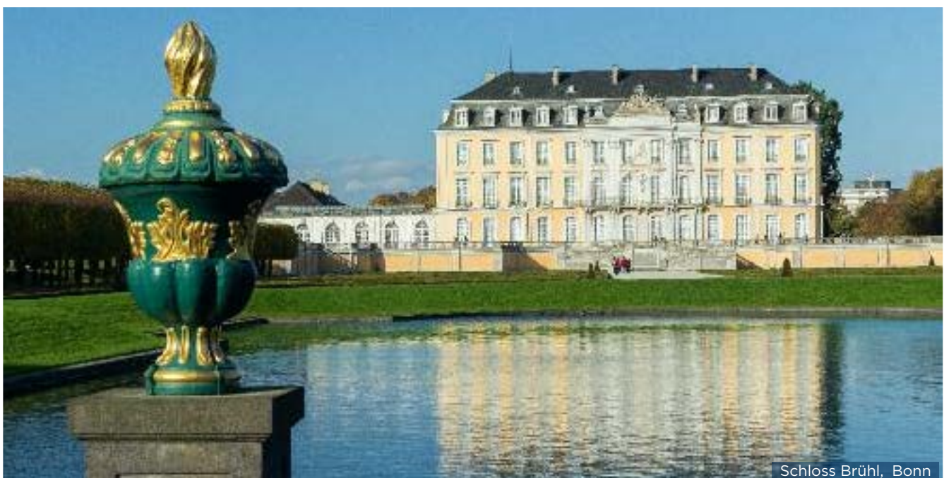
Schloss Brühl, Bonn

Set in an idyllic garden landscape, begun by architect Johann Conrad Schlaun, and finished by François de Cuvilliés, the Brühl Palaces of Augustusburg Castle and Falkenlust are among the earliest and best examples of 18th century Rococo architecture in Germany. Protected by UNESCO as a site of World Cultural and Natural Heritage, with their extensive gardens and park grounds they are living witnesses of a glorious past.