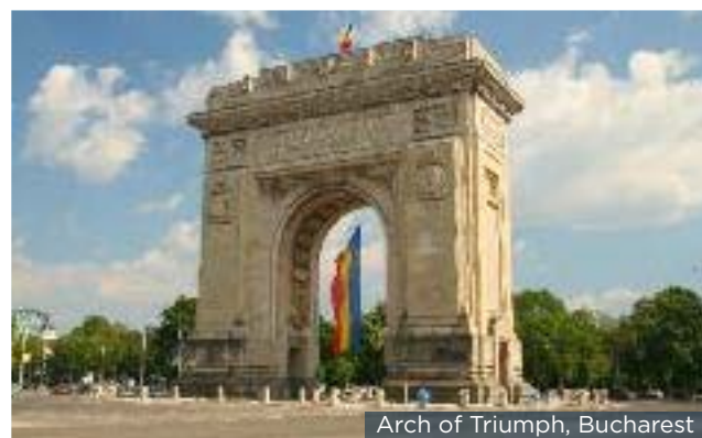
Arch of Triumph, Bucharest

We disembark MS Royal Crown in Budapest before being transferred to the airport for our accompanied flight home.