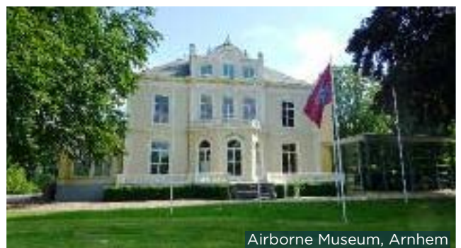
Airborne Museum, Arnhem

Enjoy a leisurely sail along some of the most scenic sections of the Danube, Main and Rhine rivers through the delightful Wachau Valley and the dramatic Rhine Gorge with their stunning vistas of vineyards and fairy-tale castles perched atop precipitous cliffs. Pages 22-29