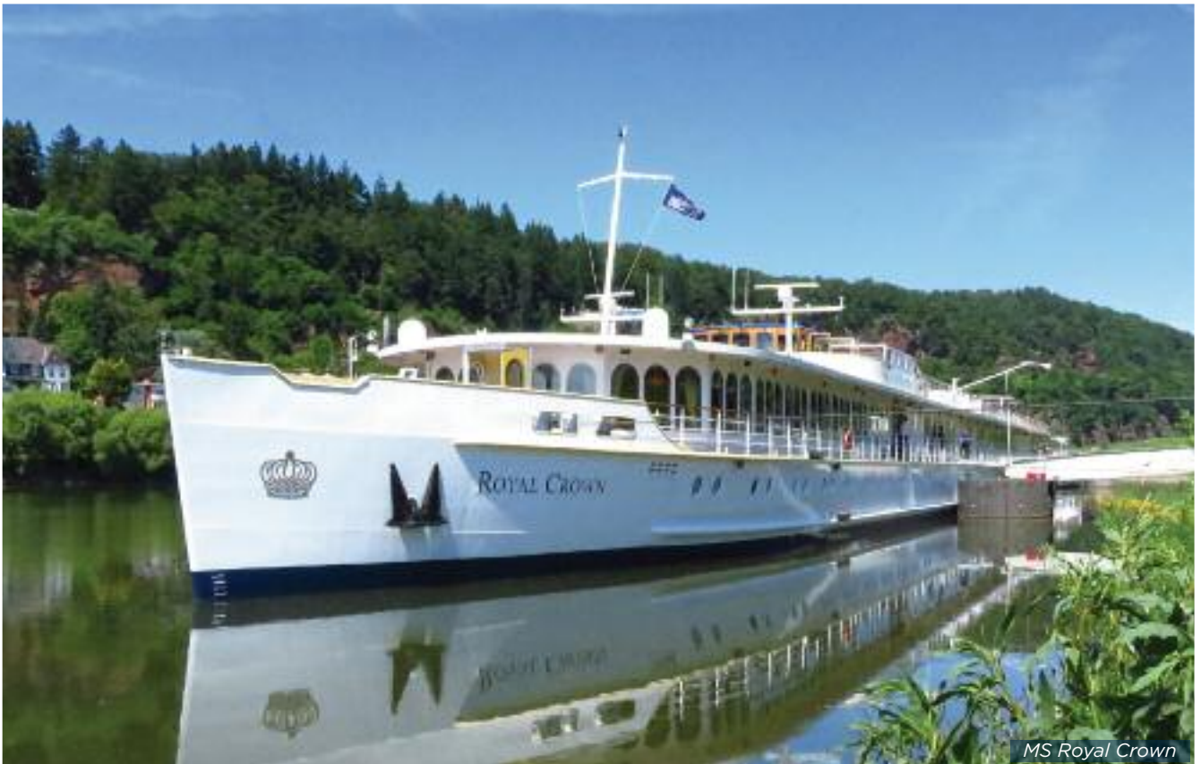
MS Royal Crown