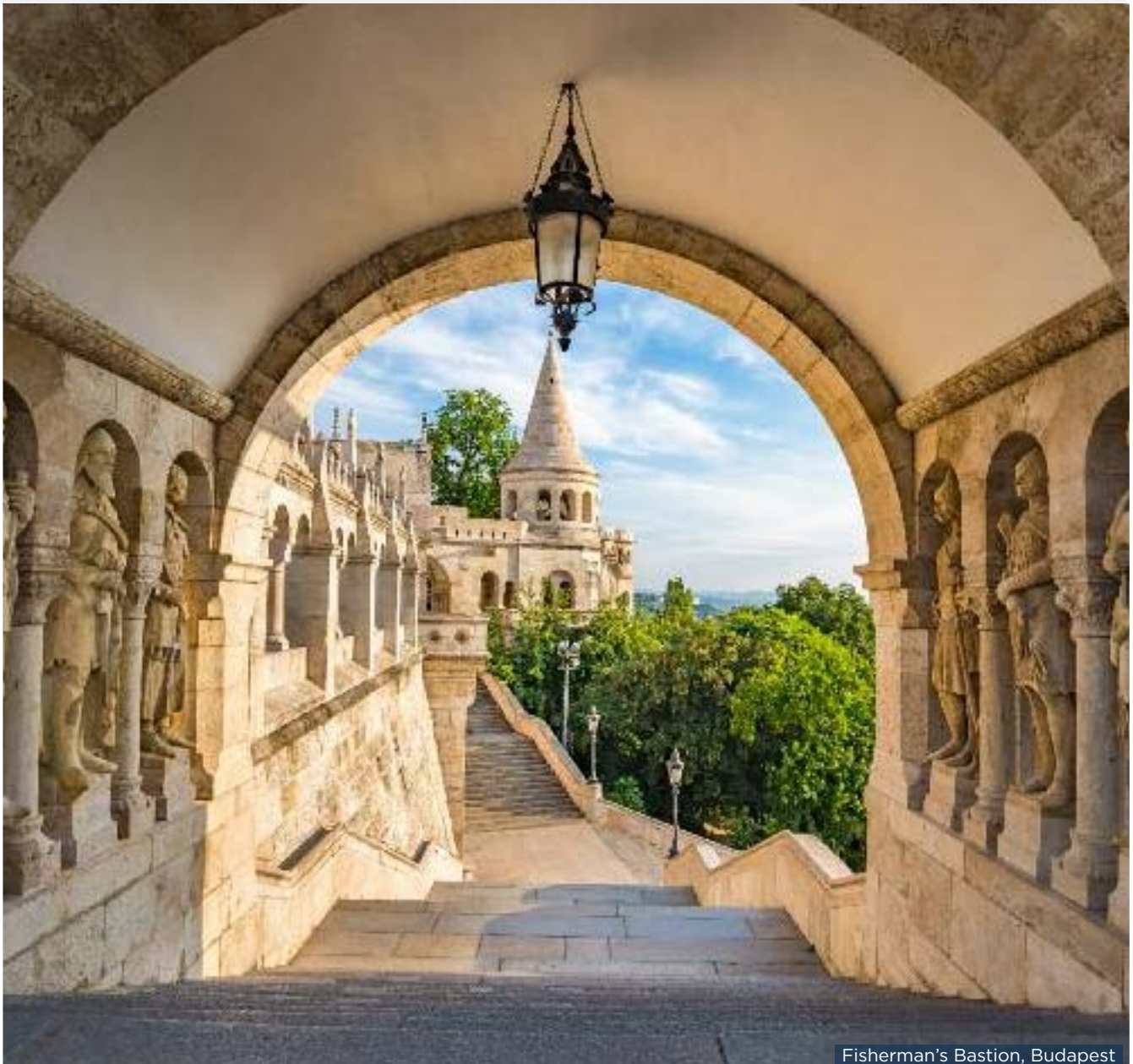
Fisherman's Bastion, Budapest

COMBINE 2 OR MORE 2019 EUROPEAN RIVER CRUISES AND SAVE AN ADDITIONAL 5% OFF THE TOTAL FARE