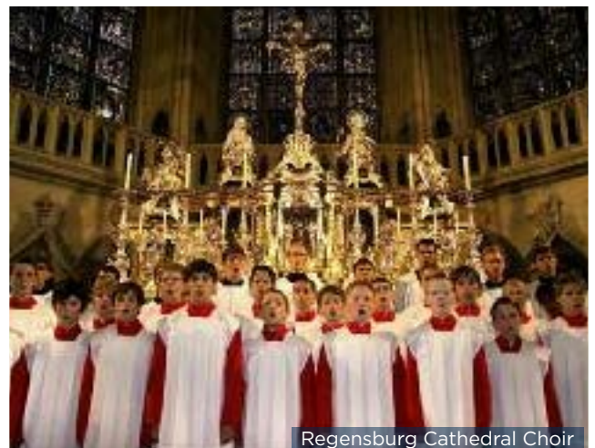
Regensburg Cathedral Choir

Full board including house wines, Taittinger champagne by the glass, spirits, beers, soft drinks, tea and coffee. All shore excursions. Guest Speaker. Cruise Director. Tour Manager. Gratuities. Complimentary Wi-Fi on board. Overseas Transfers. Port taxes. Airport taxes. Travel Insurance not included.