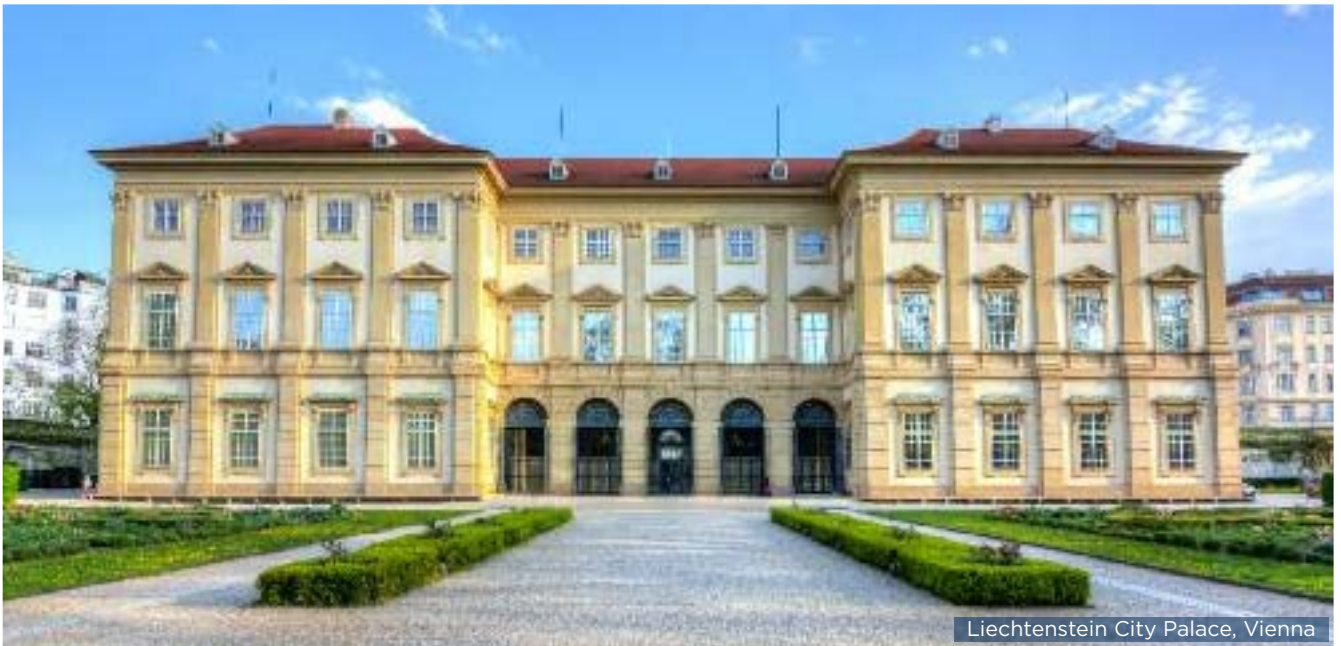
Liechtenstein City Palace, Vienna