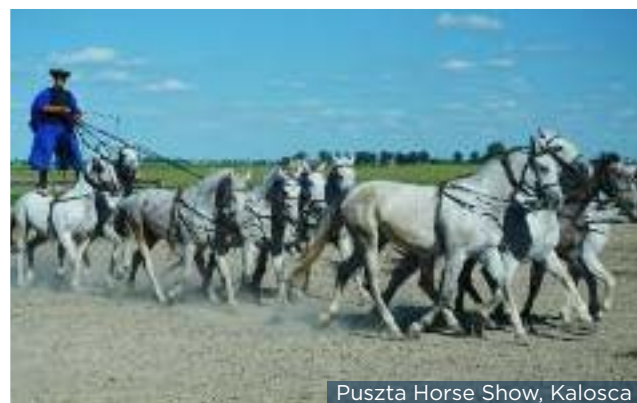
Puszta Horse Show, Kalosca