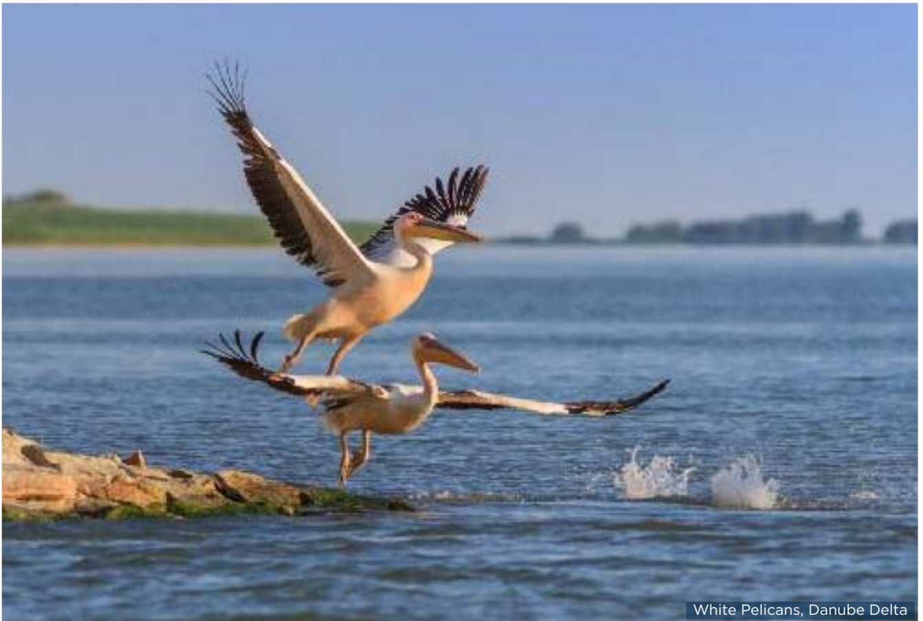
White Pelicans, Danube Delta