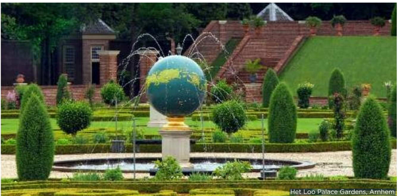
Het Loo Palace Gardens, Arnhem