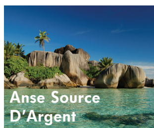
Anse Source D'Argent